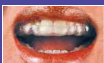
Nightguards are custom-made and easy to insert or remove.