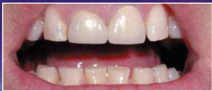
Bruxing can wear down and destroy your teeth.

D o you wake up with a stiff, tired jaw? Are your teeth sensitive to cold drinks? If you answered yes to either of these questions, you may be grinding or clenching your teeth during sleep. Grinding of the teeth is a medical condition called bruxism. Over time, bruxism will result in the wearing down of your natural tooth enamel.